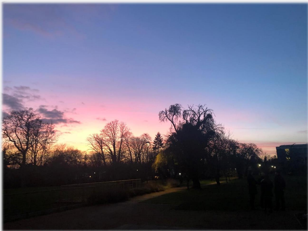
Sunset over Eddie's orchard: a view from the Richard Laws Building.

If you are an international student , the University has created a specific guide for you. The Students' Union also has plenty of information and advice for international students: https://www.international.cusu.cam.ac.uk/