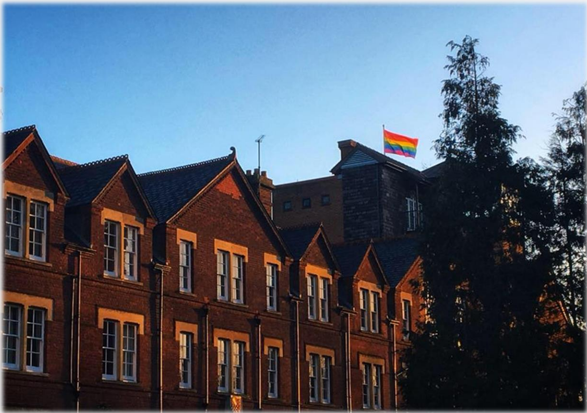
The Norfolk Building.

Esteban García, St Edmund's student 2018-2019