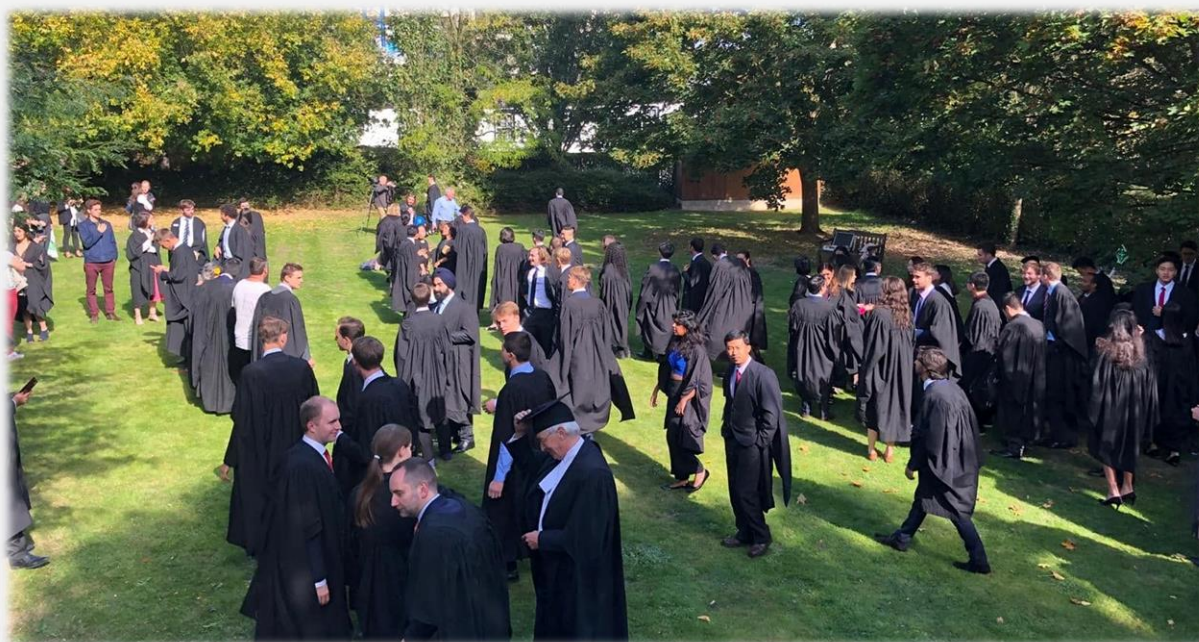
Eddie's People Assemble!

PhD students are assigned a supervisor by their department whose area of expertise is similar to their proposed thesis topic. Postgraduates work very closely with their supervisor, so it is important to develop a good relationship with them. You may also be assigned a secondary advisor and you will be assigned a College Tutor from Eddie's. All of these individuals will help you with your scholarly and personal achievements while you are at Cambridge.