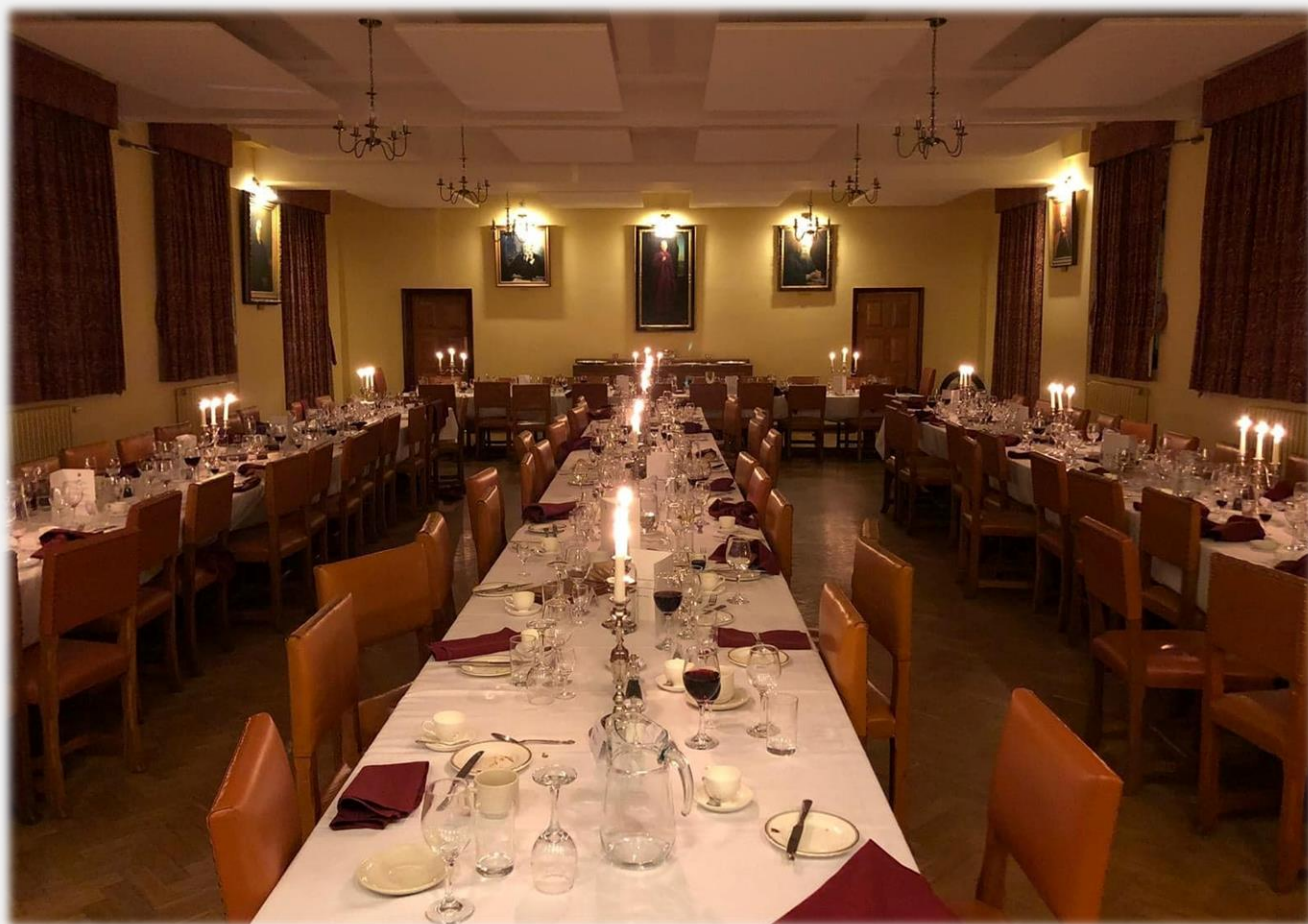
Eddie's Dining Hall after a formal.

In addition to this, there is tea, coffee, and biscuits served in the Norfolk Building CR every weekday at 11am and 3pm, and on Sundays at 4pm. This is a time where the whole college - staff and students alike - gathers and socialises.