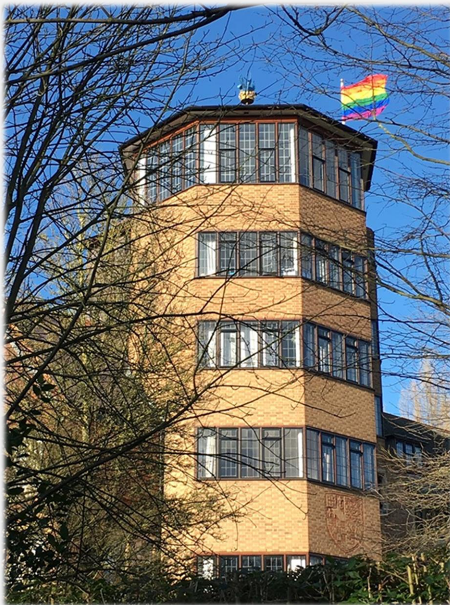
The Norfolk Building tower.