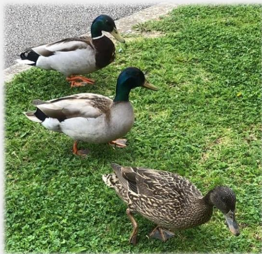
The Eddie's ducks!

For Categories 6 and 7, your address is: Mount Pleasant Halls, Mount Pleasant, Cambridge, CB3 0BL