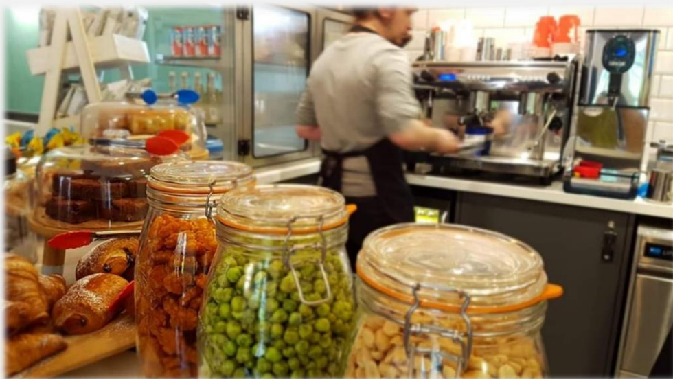
Edspresso in action!

The College's coffee shop – Edspresso – is open Monday to Friday from 9.30am to 8pm. On offer are a range of food items such as sandwiches and salads, sweets and savoury snacks, and an array of hot and cold drinks.