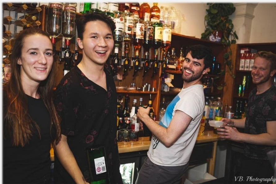
Eddie's Bar in full swing!

Eddie's Bar epitomises the informal and international ethos of our College. It is a unique place, and the heart of our community. It is managed and run by Eddie's students and offers a great range of drinks, including high-quality spirits, selected wines and whiskeys, and international lagers – all at student-friendly low prices. If you are interested in receiving training to become a member of the bar staff, please contact the bar stewards ( cr-bar@st-edmunds.cam.ac.uk ). All Eddie's bar staff are unpaid volunteers.